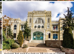
Ankara Art and Sculpture Museum building