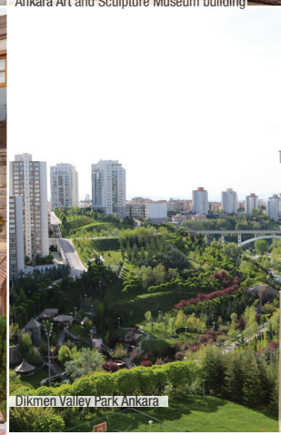
Dikmen Valley Park Ankara