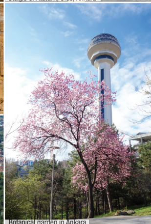
Botanical garden in Ankara