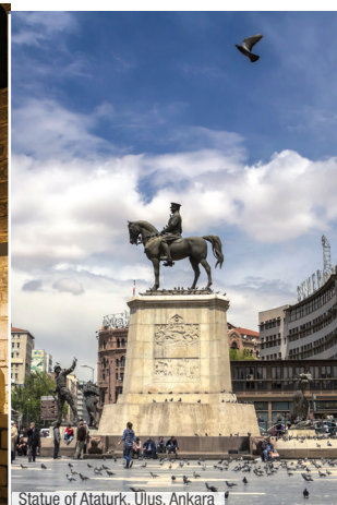
Statue of Ataturk, Ulus, Ankara