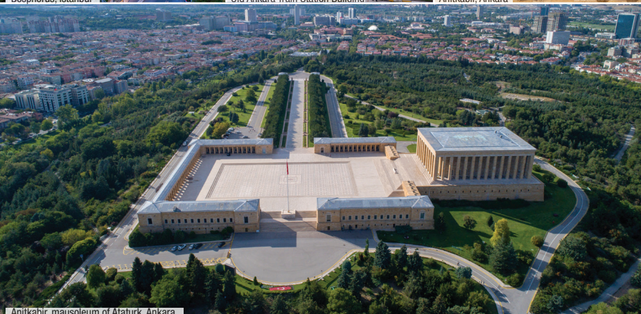
Anitkabir, mausoleum of Ataturk, Ankara