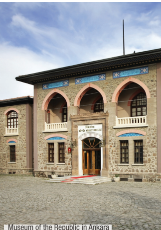
Museum of the Republic in Ankara