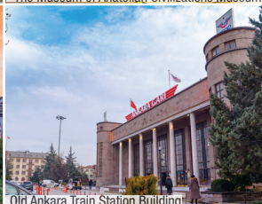
Old Ankara Train Station Building