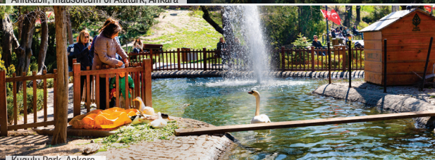
Kugulu Park, Ankara