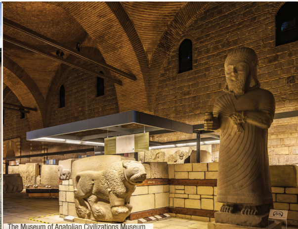
The Museum of Anatolian Civilizations Museum