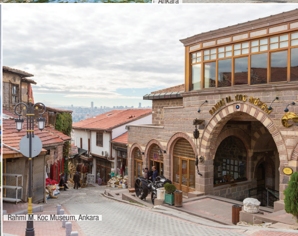
Rahmi M. Koc Museum, Ankara