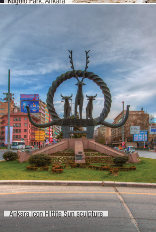
Ankara jcon Hittite Sun sculpture