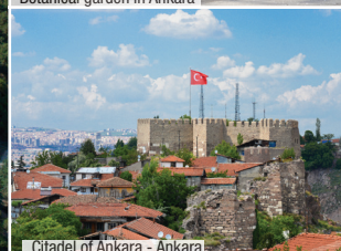
Citadel of Ankara - Ankara