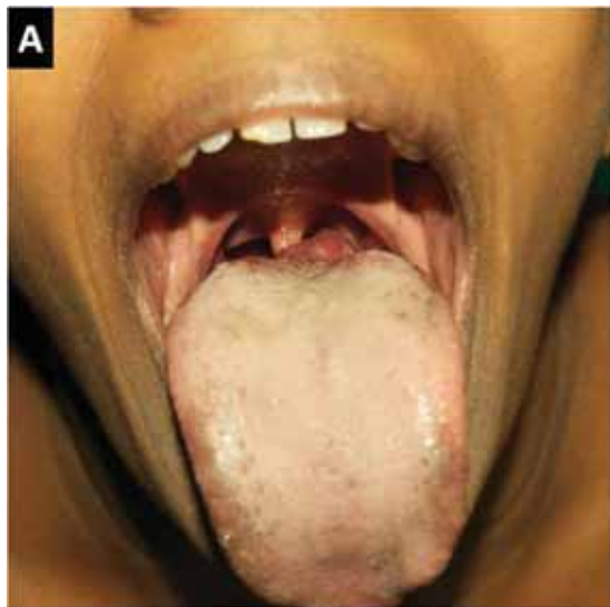
Fig. 1 - A. Lingual Thyroid

I have designed a unique technique for excising Lingual thyroid through a different route - suprahyoid approach- in which the lingual thyroid is excised under direct vision. The entire procedure can be performed within 45 minutes with minimal blood loss (less than 30ml.) The results have been excellent in all cases and patients were started on liquid diet on the 6th post operative day. Above all, this procedure can be performed by a surgeon with ease and without complications and blood loss. Hence, I strongly recommend this Suprahyoid approach for excising the Lingual thyroid.