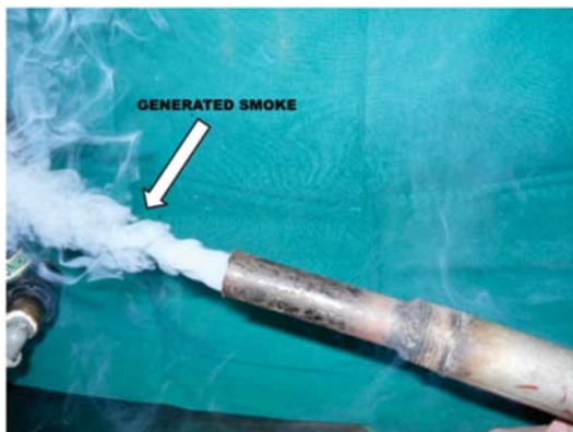
Figure 1: Thick white smoke

Chemical analysis of cow's urine before and after the procedure did not show any change in pH value. The color has changed from pale straw yellow to straw yellow post testing. Specific gravity has changed from 1.015 to 1.020, urea 114 to 126mg, creatinine 34 to 36.2 mg, calcium 3.5 to 3.9, potassium 97 to 101 ( Table 4 ).