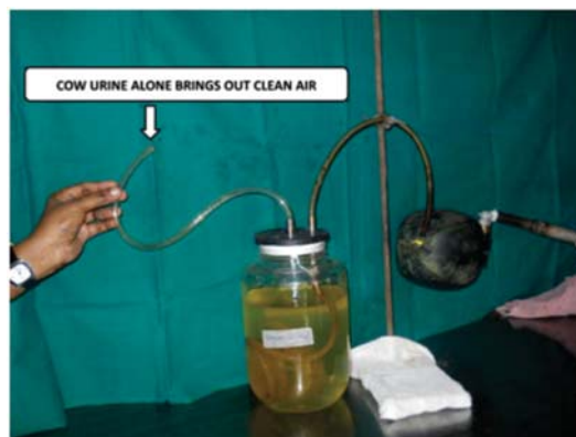
Figure 4: Out coming clean air