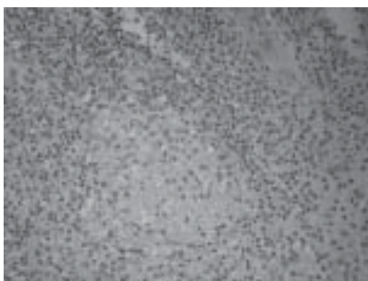
Image 2c: (400X H & E) Deep dermis inflammation with epitheloid cell granulomas with and central necrosis

Image 2b: (200XH&E): Epidermis with upper dermis showing epitheloid cell granuloma and extensive necrosis