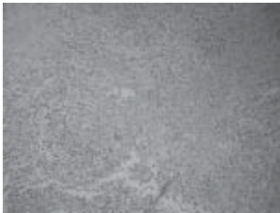
Image 2a : (100X H&E) necrosis with granuloma with and giant cells