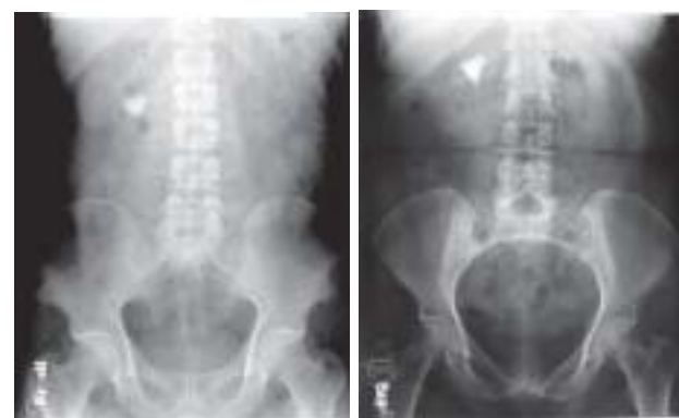
Fig. 2A & B: Plain abdominal radiographs showing densely calcified right renal stones (different patients) suggesting calcium containing stones.

product of the two ions exceeds the solubility of the product. Hypercalcemia is a common cause of hypercalciuria and may result from a variety of metabolic processes. Hypercalciuria may be idiopathic and this is probably the most common cause of nephrolithiasis. Pure calcium phosphate and calcium monohydrate stones are the densest per volume of stone. (Fig. 2A & B) This fact is important since these stones are less amenable to ESWL. Calcium oxalate dihydrate stones are considered fragile and have a spiculated or mulberry / dotted configuration.