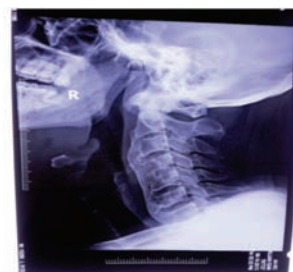
Fig 3. Lat view x-ray neck showing the air in the submandibular region with thickening of soft tissue, and paravertebral Soft tissue.